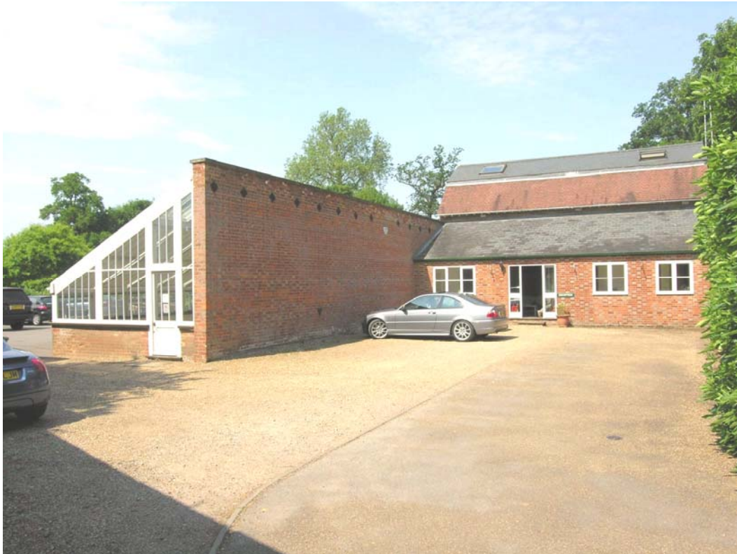
The Bothy, Albury Park, Albury, GU5 9BH

Delightful semi-rural location within Albury Park