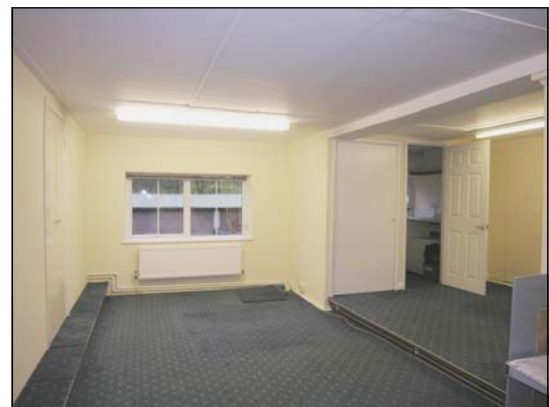
Suite 1 Tannery Building